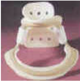
Head master Collar